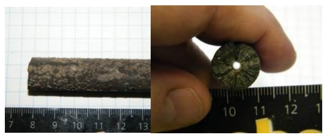
Figure 2. Samples of crystalline deposit ( FeCO_{3} ) removed from a tube side from Lean-Rich amine exchanger.

The main fouling component FeCO<sub>3</sub> ( siderite ) had been the main problem of concern for over the past 25 years. Turnaround crews employed everything from the latest high pressure water cleaning 'rotating tips' at 40, 000 PSI, to the harshest of chemical including HCL baths to break out the siderite from the tubes. From recent accounts using these methods our client reported that each method provided minimal cleaning results with major expense involved with the amount of "rotating tips' destroyed, chemical stress fracturing of tubes, significant water used in the cleaning process and the over-all time required to clean just 4 units of the one train of 106C Hx Units.